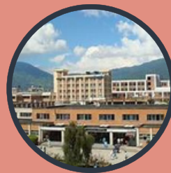
Tribhuvan University Institute of Medicine Nepal