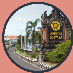
Udayana University Indonesia

This month, we welcome two new university members: